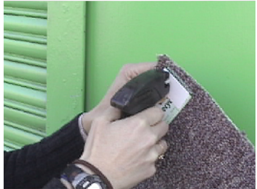
Avery® Original Mark III Fastening Gun